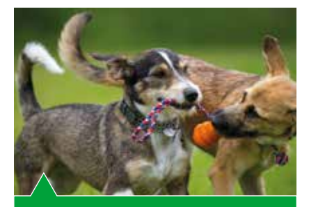
If your dog enjoys playing with you, make sure that you find time each day to play tug, throw a ball, or let them play with friends.