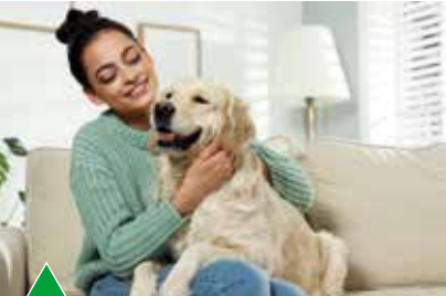
If your dog enjoys physical contact with you, make sure that you find time each day to pet them , groom them, and allow them to cuddle you and be close.